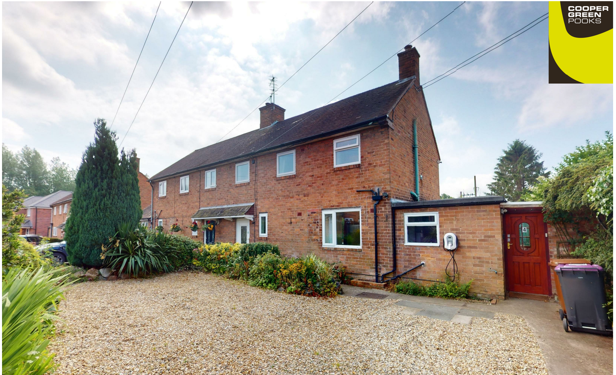
4, Mayfields, Kinnerley, Oswestry, SY10 8DF £1,100 Per Month