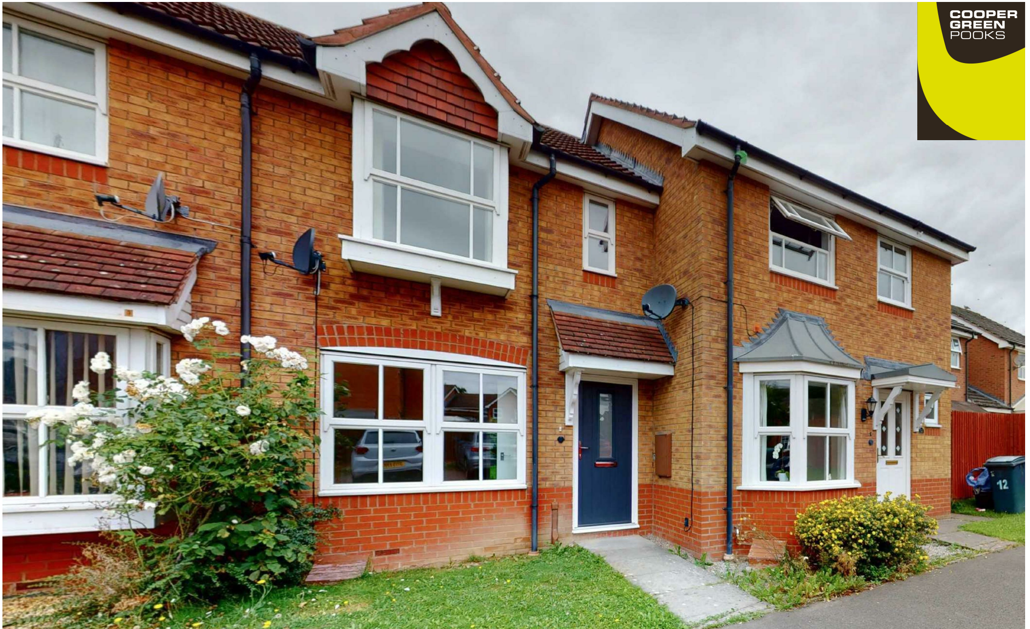
14, Farran Grove, Berwick Grange, Shrewsbury, SY1 4YB £850 Per Month