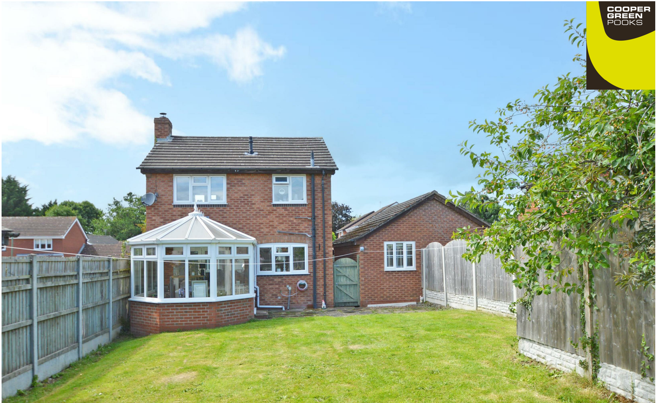
5, Churchill Road, Copthorne, Shrewsbury, SY3 8ZA £315,000