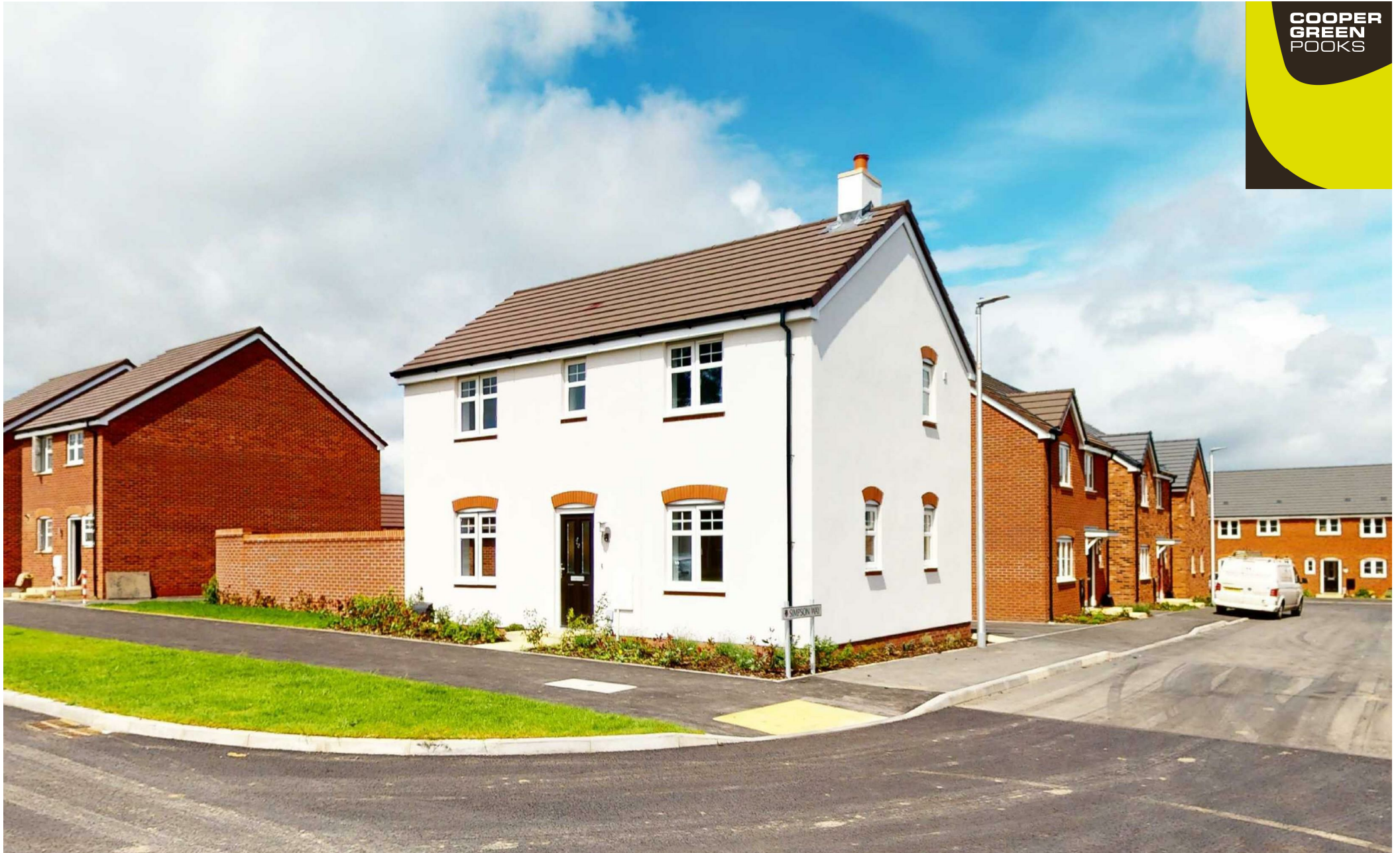
28, Maxfield Drive, Oteley Gardens, Oteley Road, Shrewsbury, SY2 6GE £1,350 Per Month