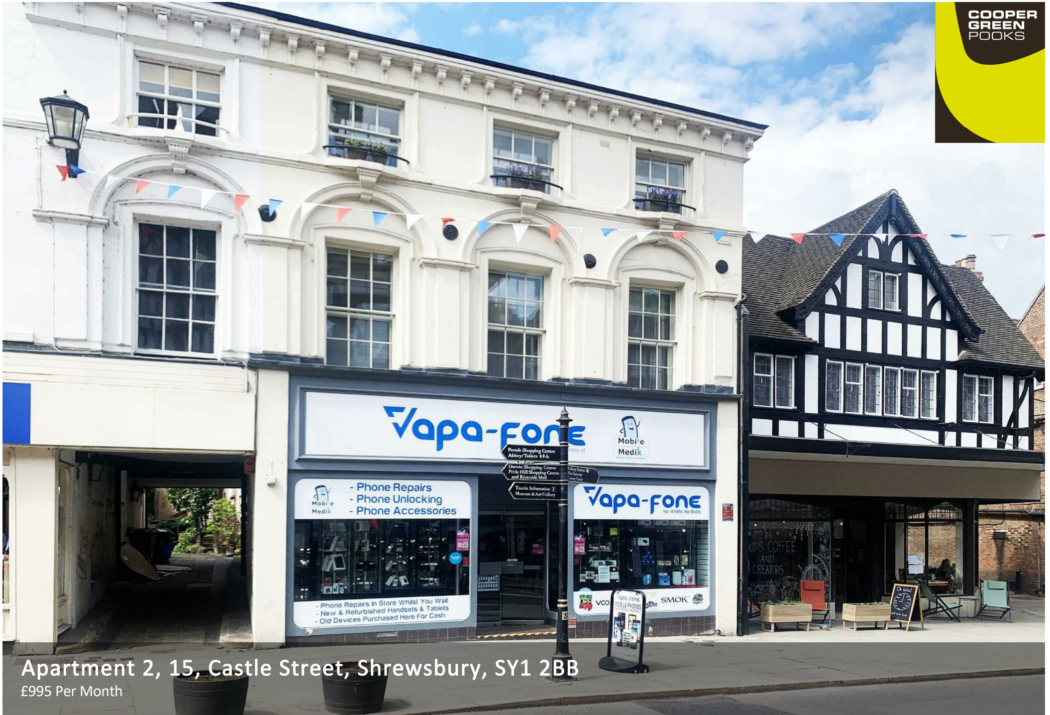
Apartment 2, 15, Castle Street, Shrewsbury, SY1 2BB £995 Per Month