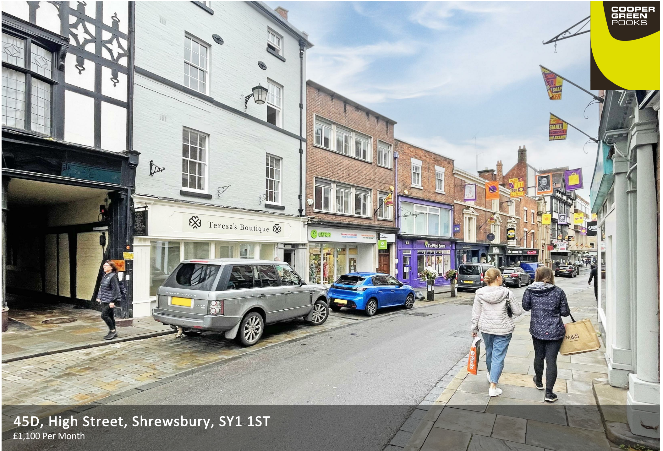
45D, High Street, Shrewsbury, SY1 1ST £1,100 Per Month