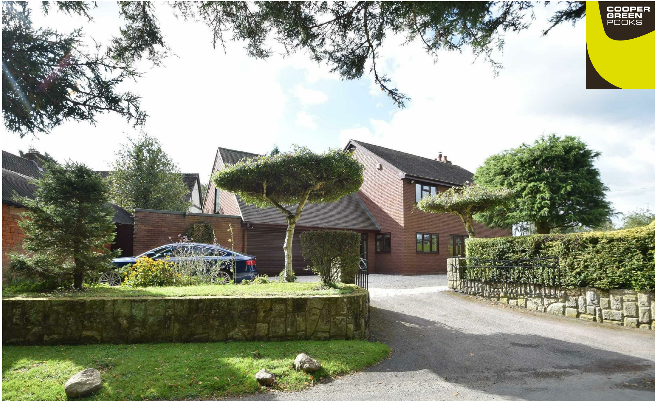
The Squirrels, Astley, Shrewsbury, SY4 4BP £1,950 Per Month