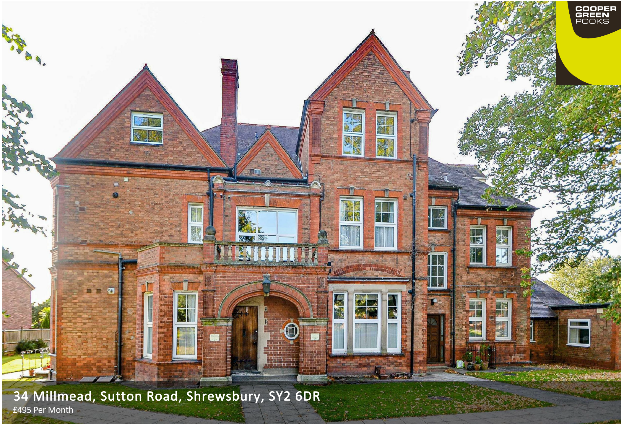
34 Millmead, Sutton Road, Shrewsbury, SY2 6DR £495 Per Month