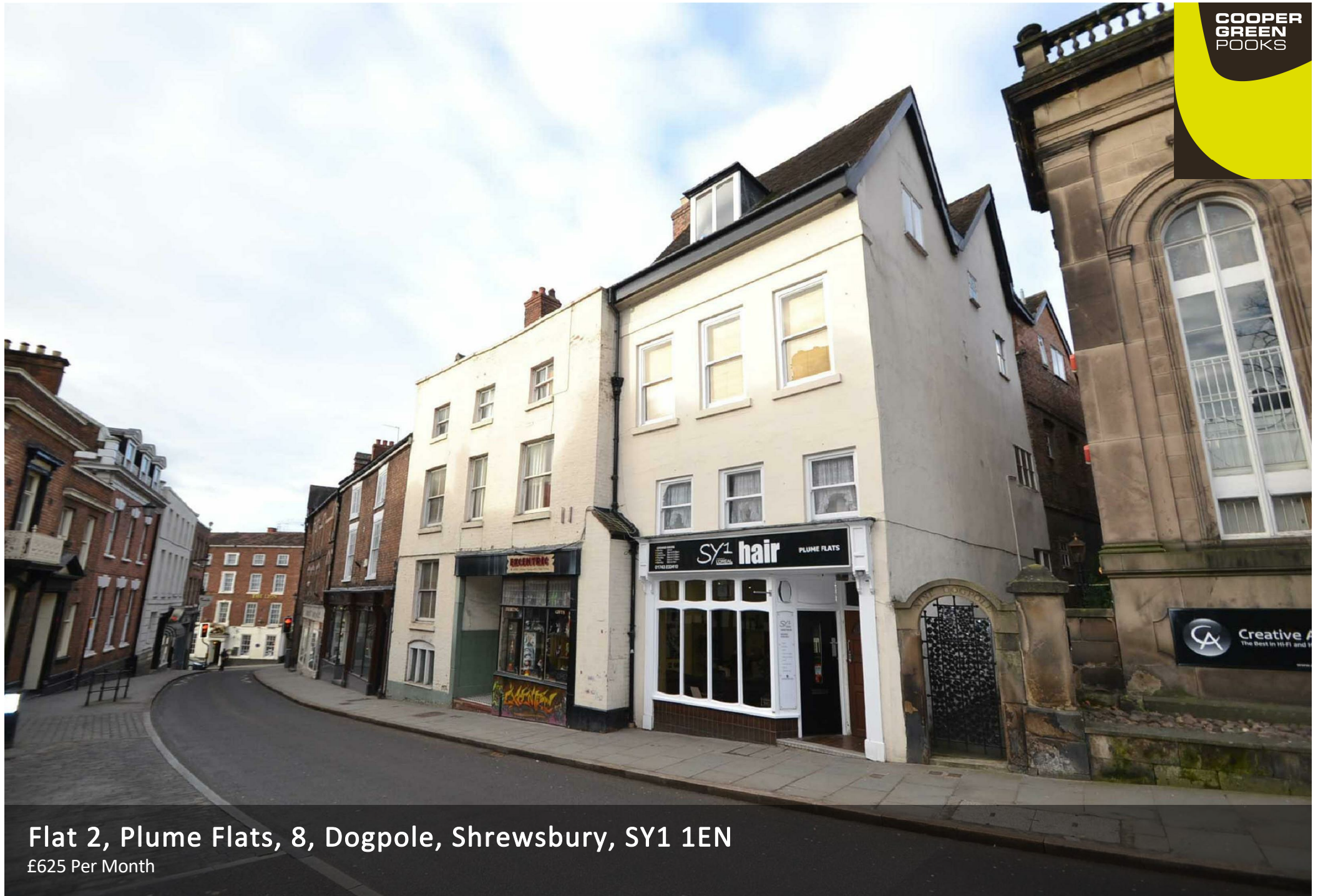
Flat 2, Plume Flats, 8, Dogpole, Shrewsbury, SY1 1EN £625 Per Month