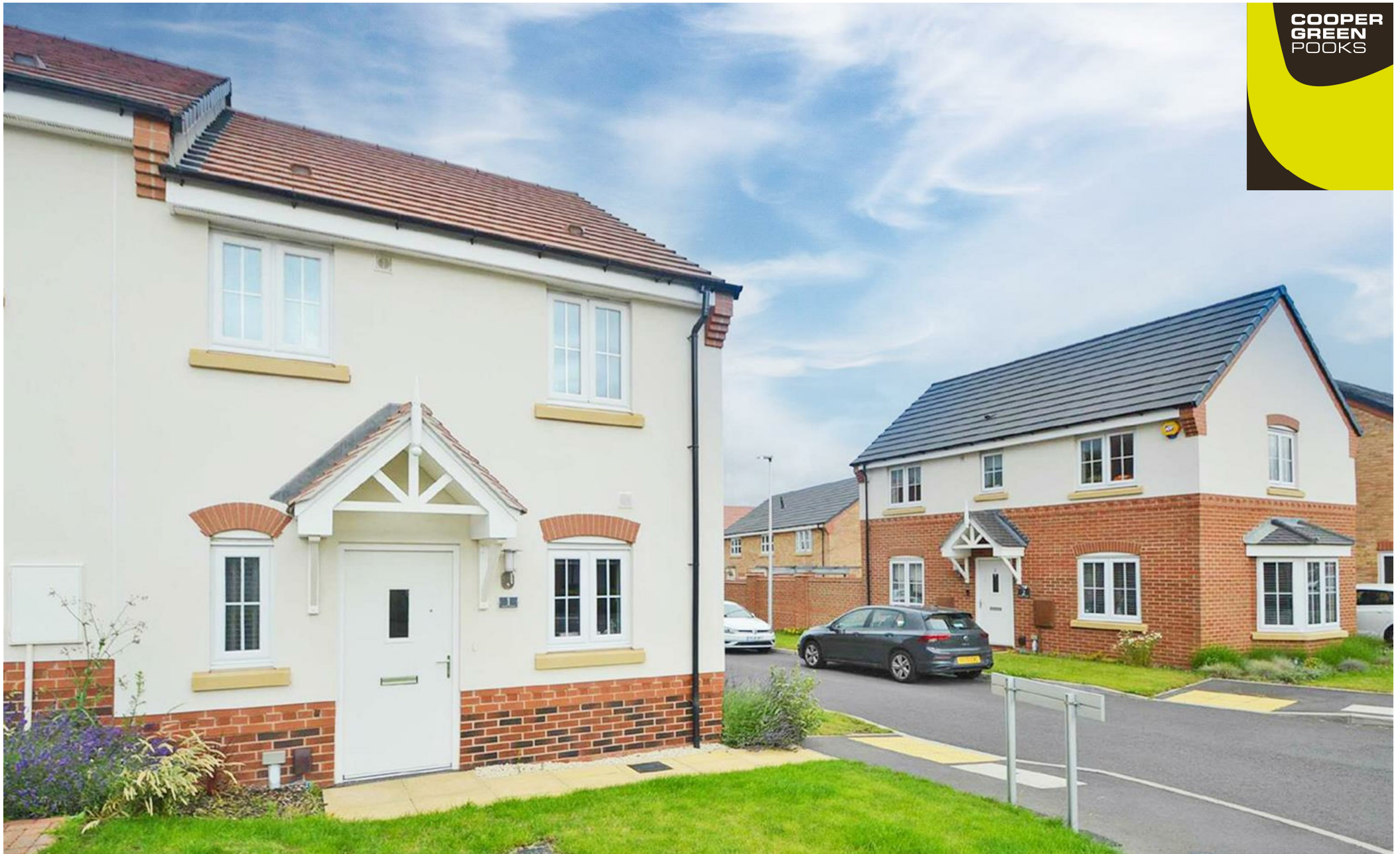
1, Passey Close, Oteley Road, Sovereign Park, Shrewsbury, SY2 6JL £1,100 Per Month