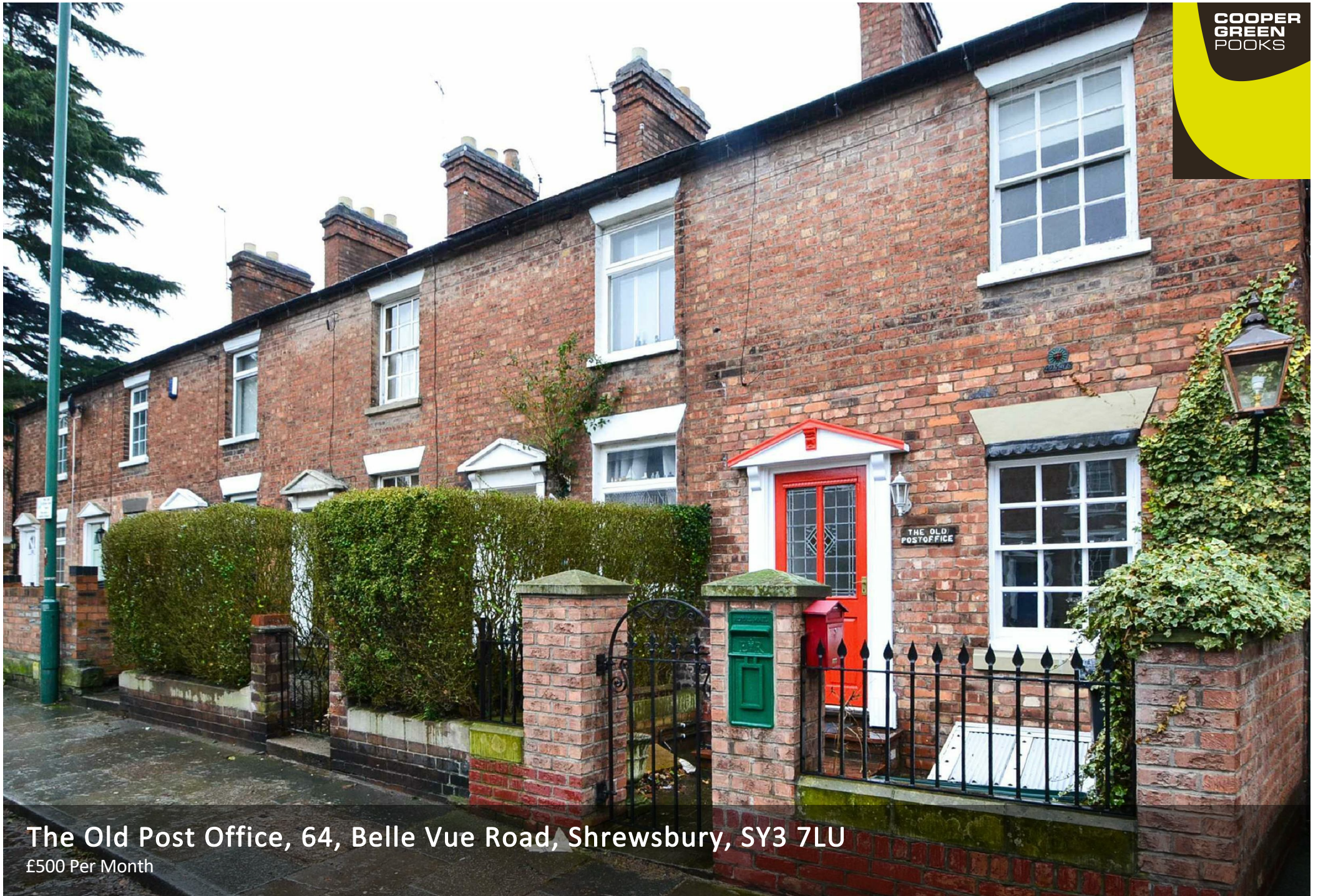
The Old Post Office, 64, Belle Vue Road, Shrewsbury, SY3 7LU