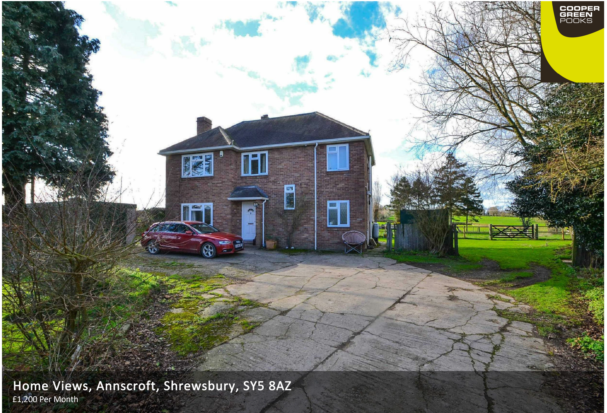
Home Views, Annscroft, Shrewsbury, SY5 8AZ £1,200 Per Month