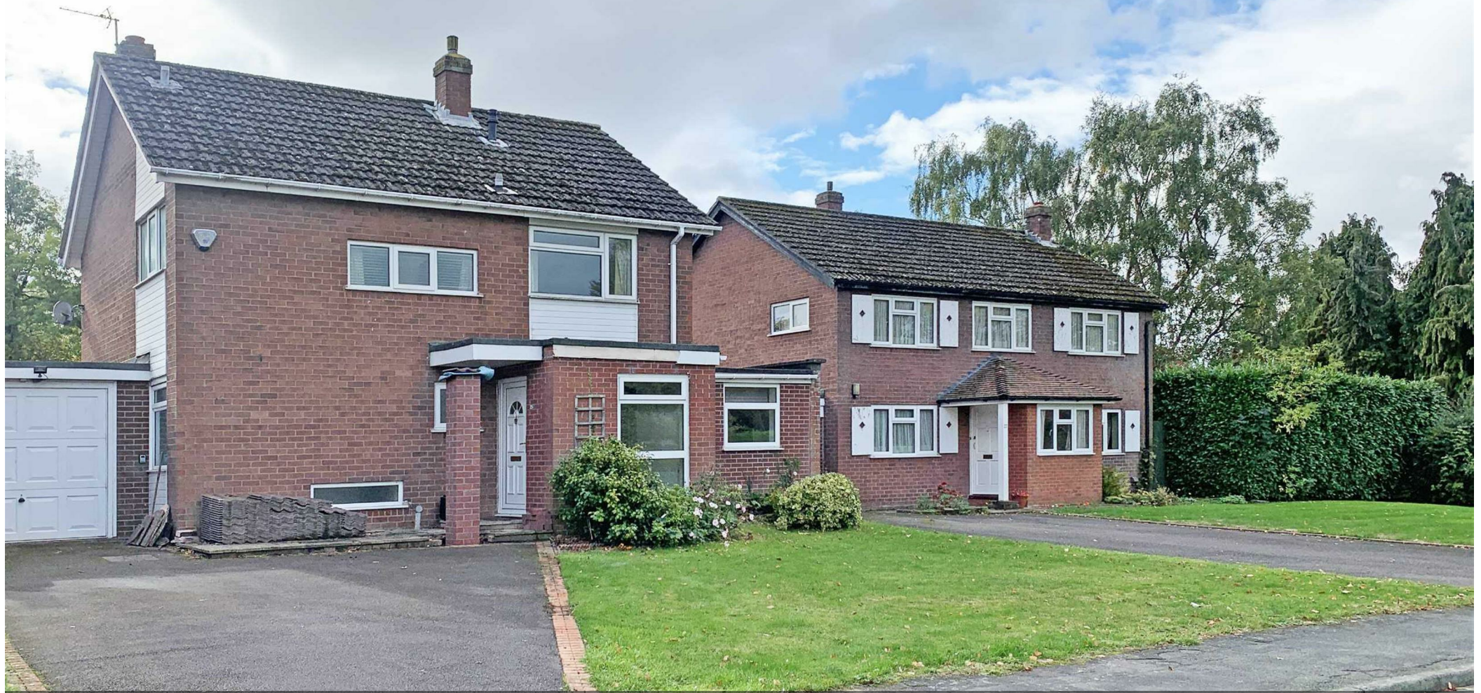
25, Clarkefields, Bayston Hill, Shrewsbury, SY3 0ES £1,200 Per Month