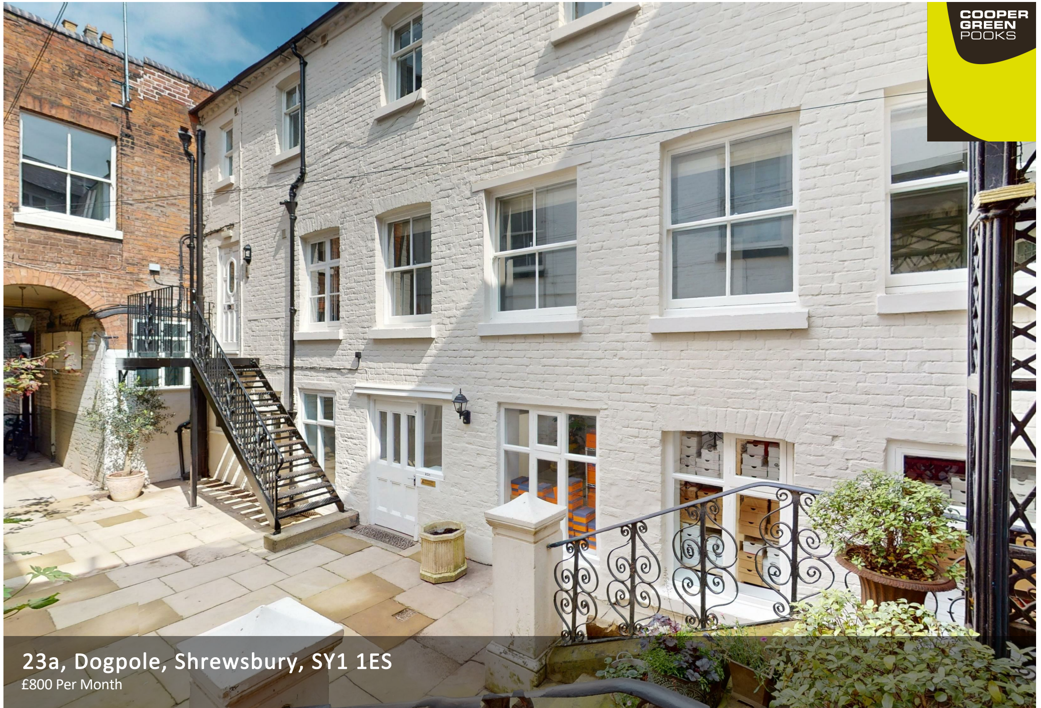
23a, Dogpole, Shrewsbury, SY1 1ES £800 Per Month