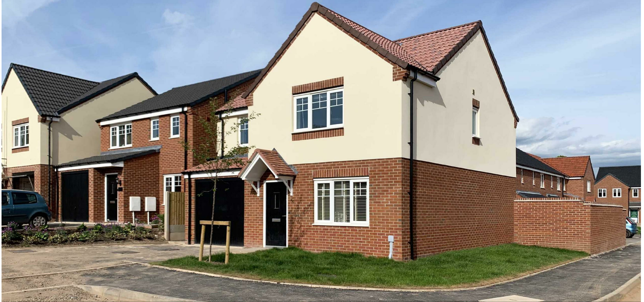
56, Davison Drive, Weir Hill Preston Street, Shrewsbury, SY2 5WE £1,500 Per Month