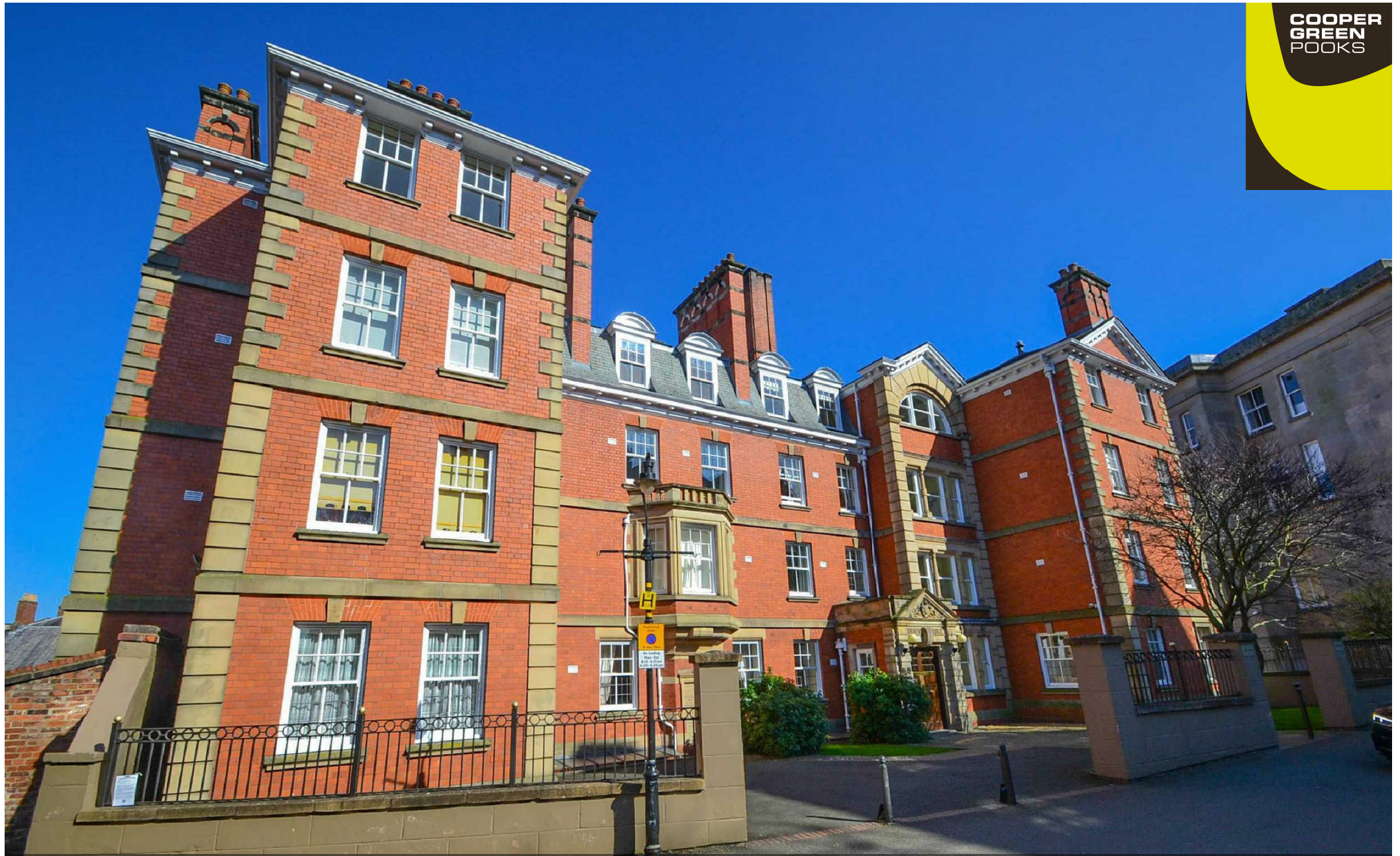
Apartment 12, Watergate Mansions, St Mary's Place, Shrewsbury, SY1 1DW £550 Per Month