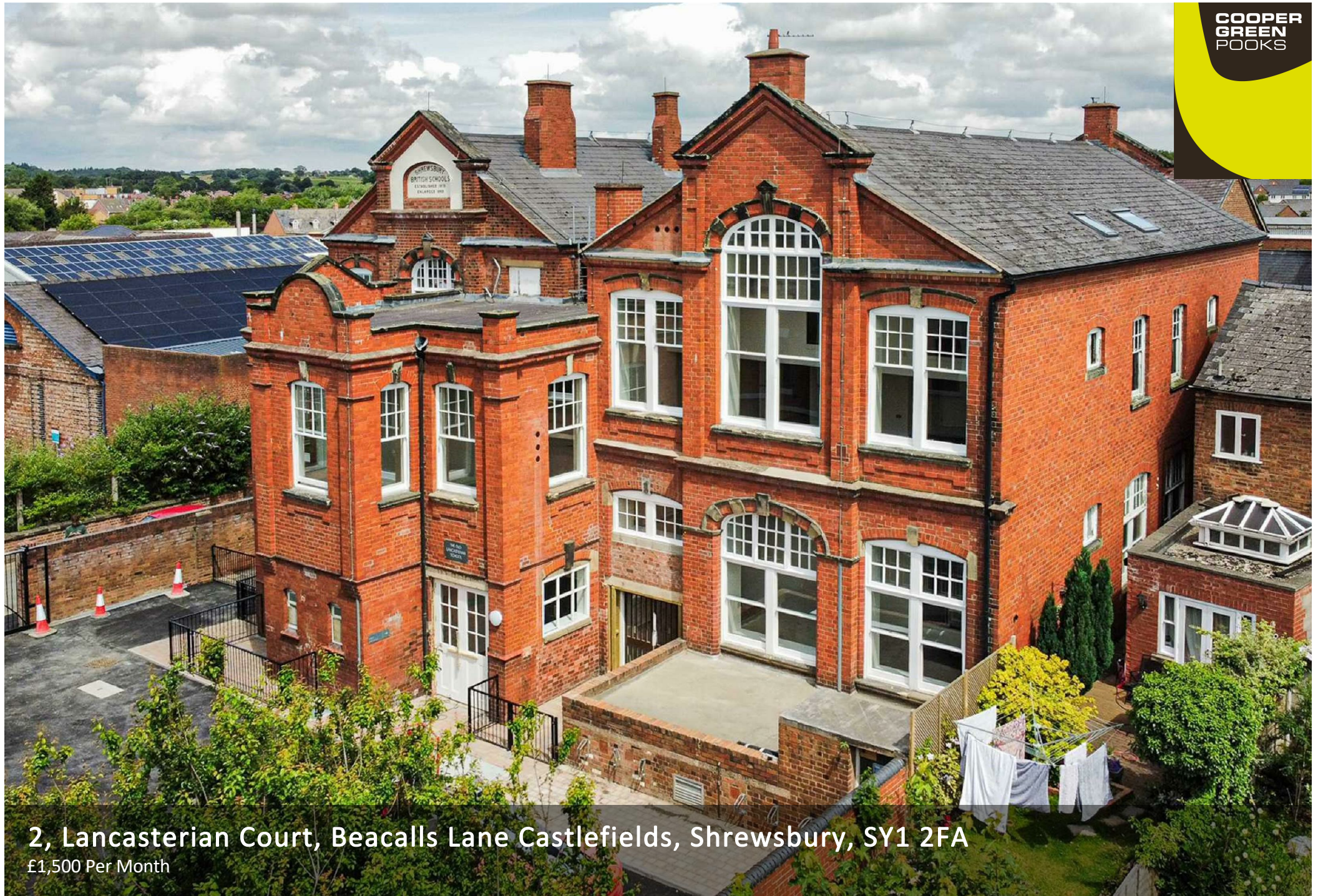
2, Lancasterian Court, Beacalls Lane Castlefields, Shrewsbury, SY1 2FA £1,500 Per Month