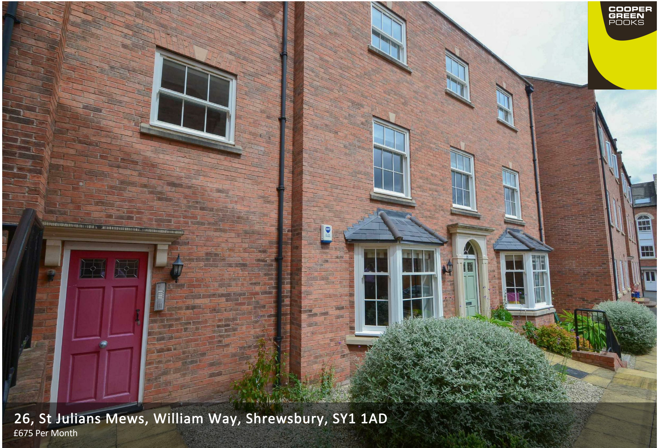
26, St Julians Mews, William Way, Shrewsbury, SY1 1AD £675 Per Month