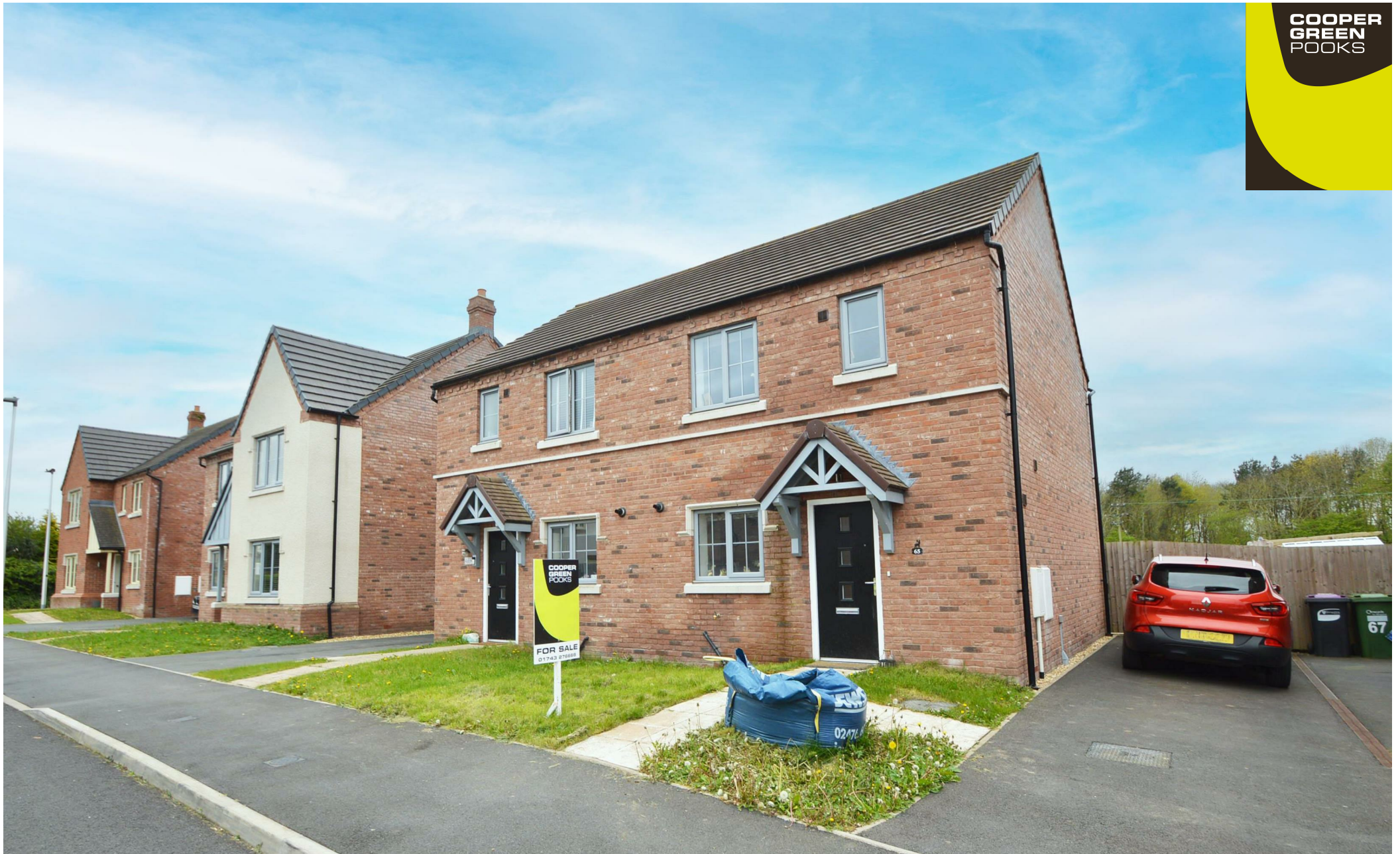
65, Roden Grove, Wem, SY4 5HJ £230,000