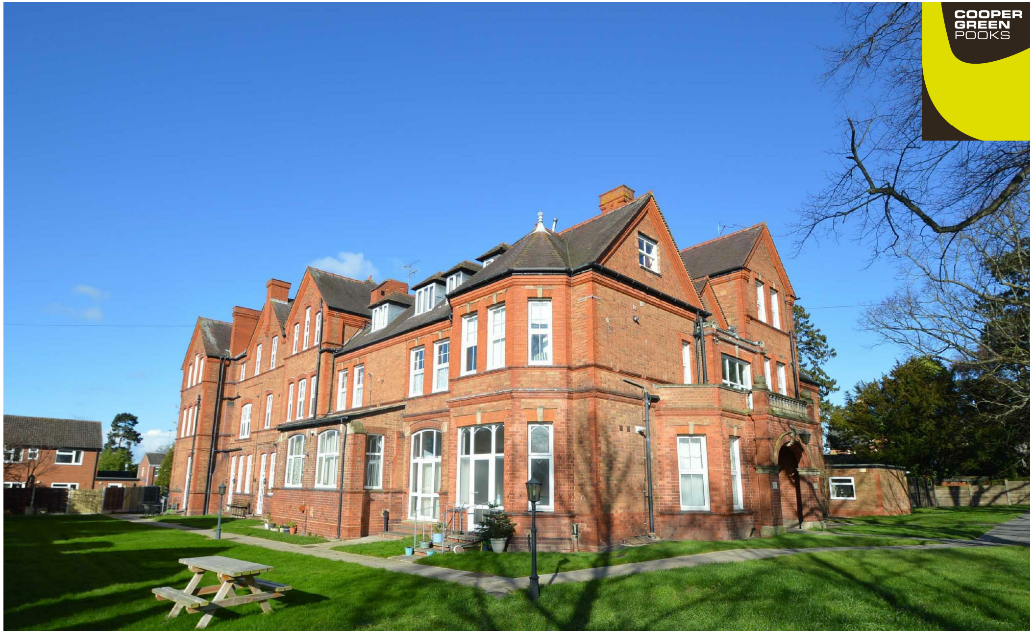
31 Millmead, Sutton Road, Shrewsbury, SY2 6DR £400 Per Month