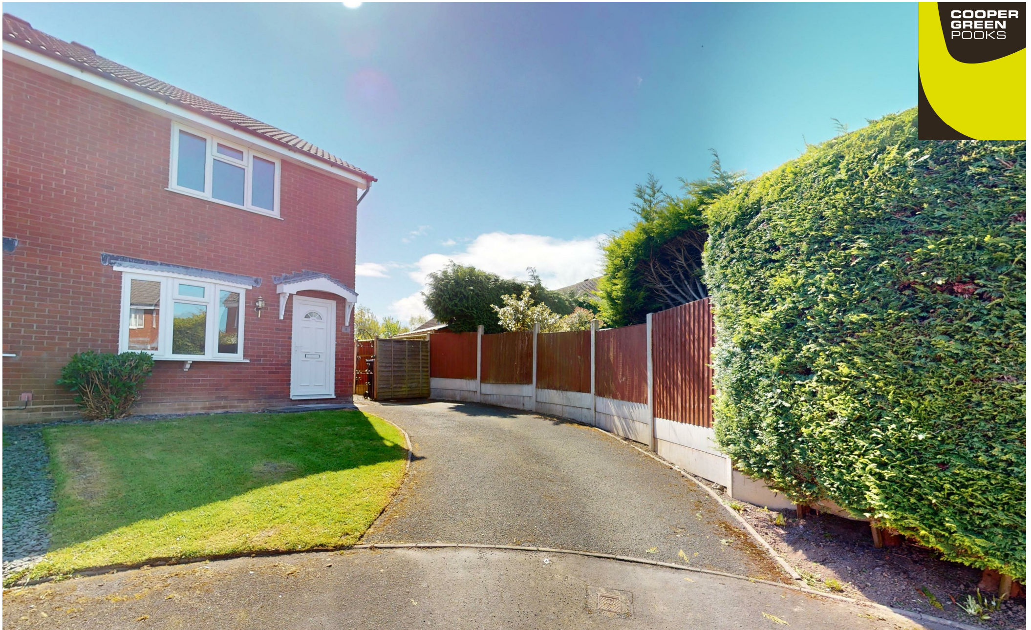
9, St Andrews Road, Radbrook Green, Shrewsbury, SY3 6BH £850 Per Month