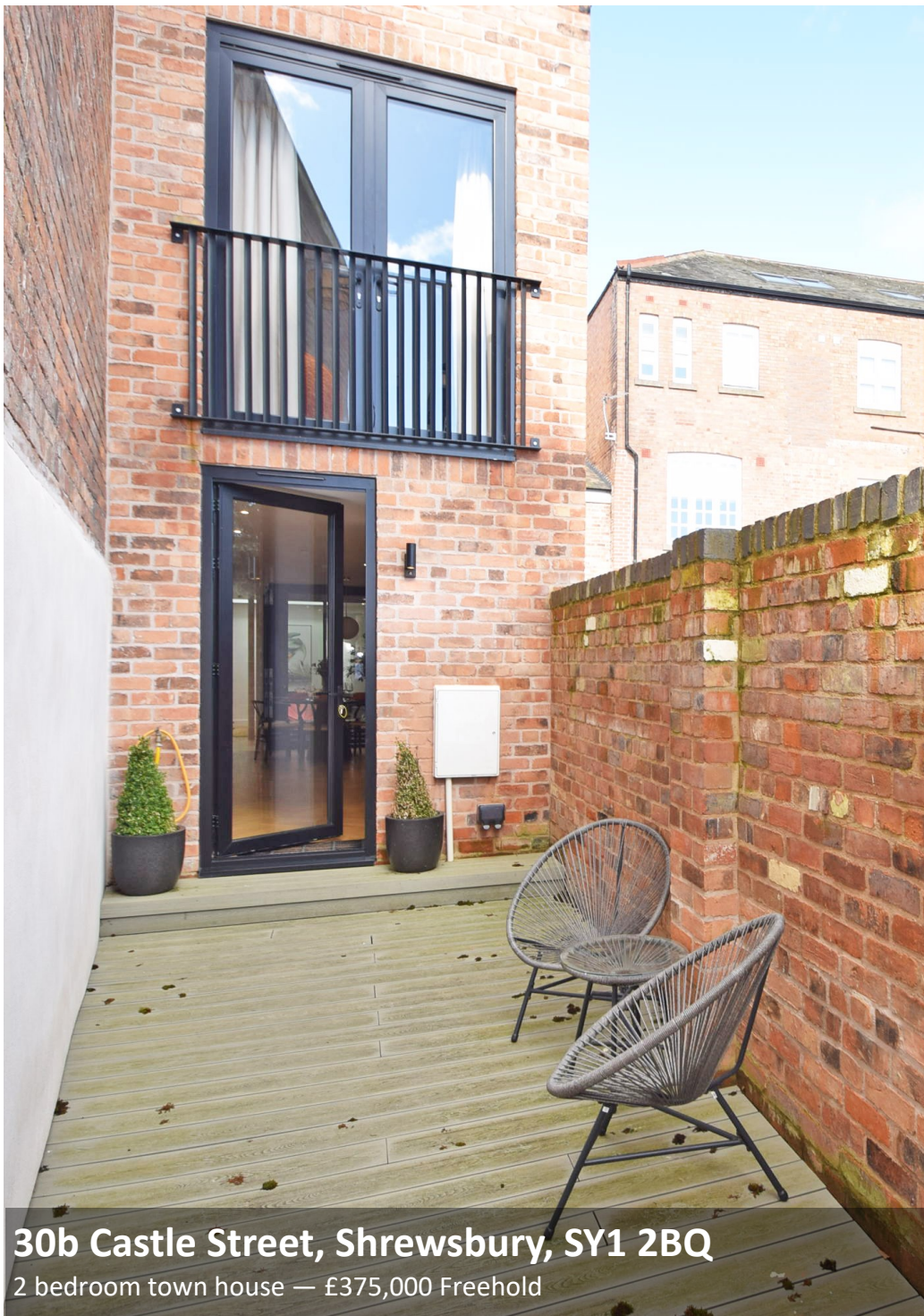
30b Castle Street, Shrewsbury, SY1 2BQ 2 bedroom town house — £375,000 Freehold