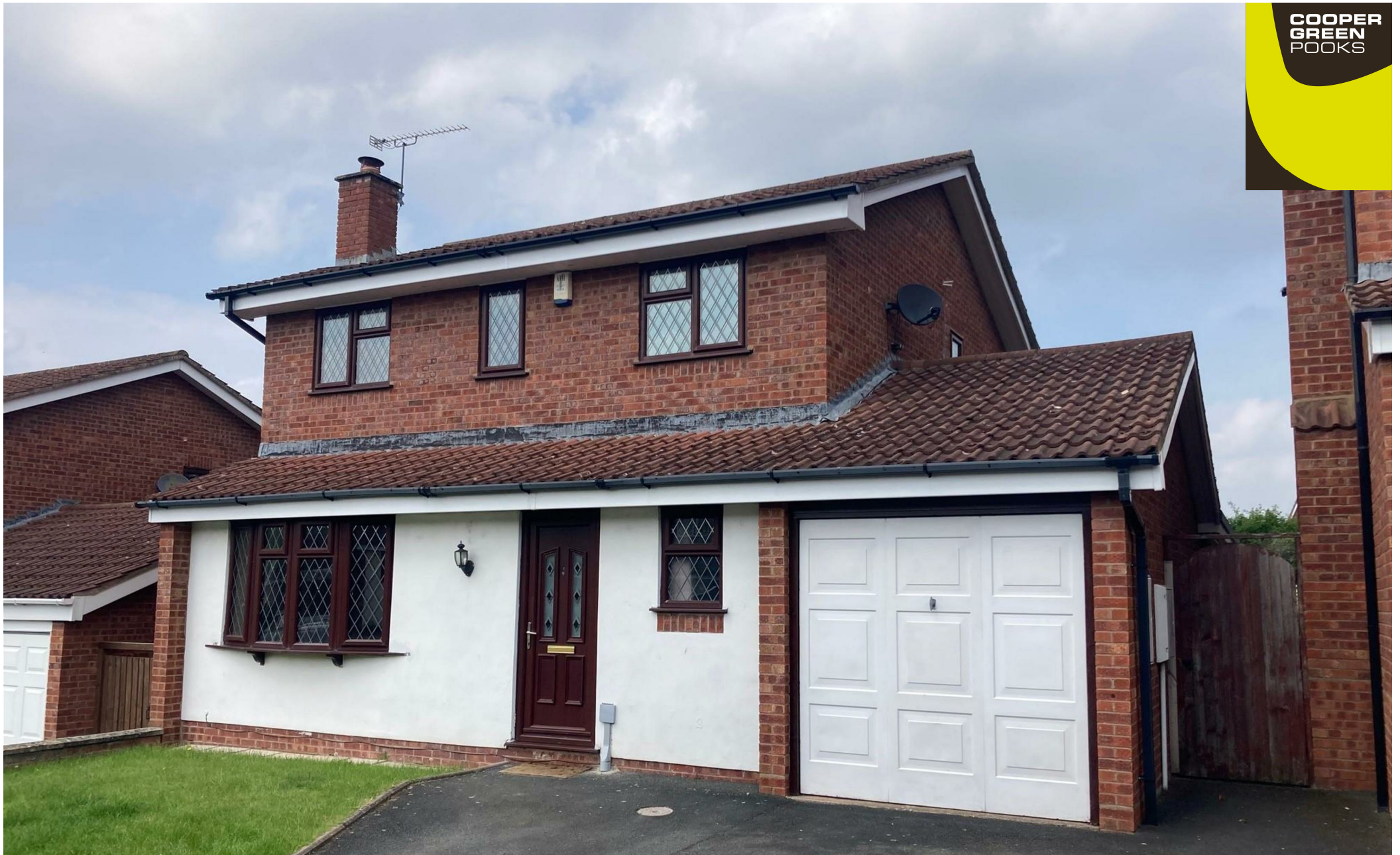
9, Rothley Close, Radbrook Green, Shrewsbury, SY3 6AN £1,300 Per Month