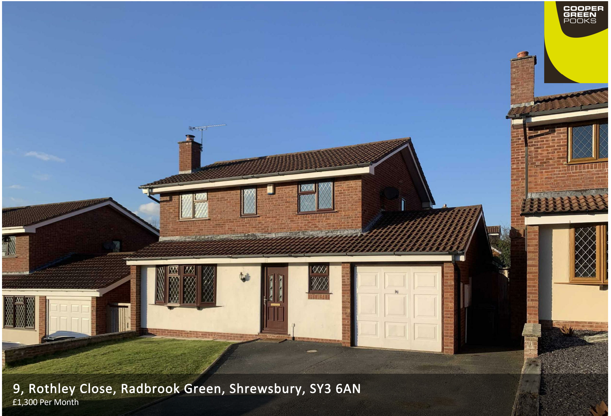
9, Rothley Close, Radbrook Green, Shrewsbury, SY3 6AN £1,300 Per Month