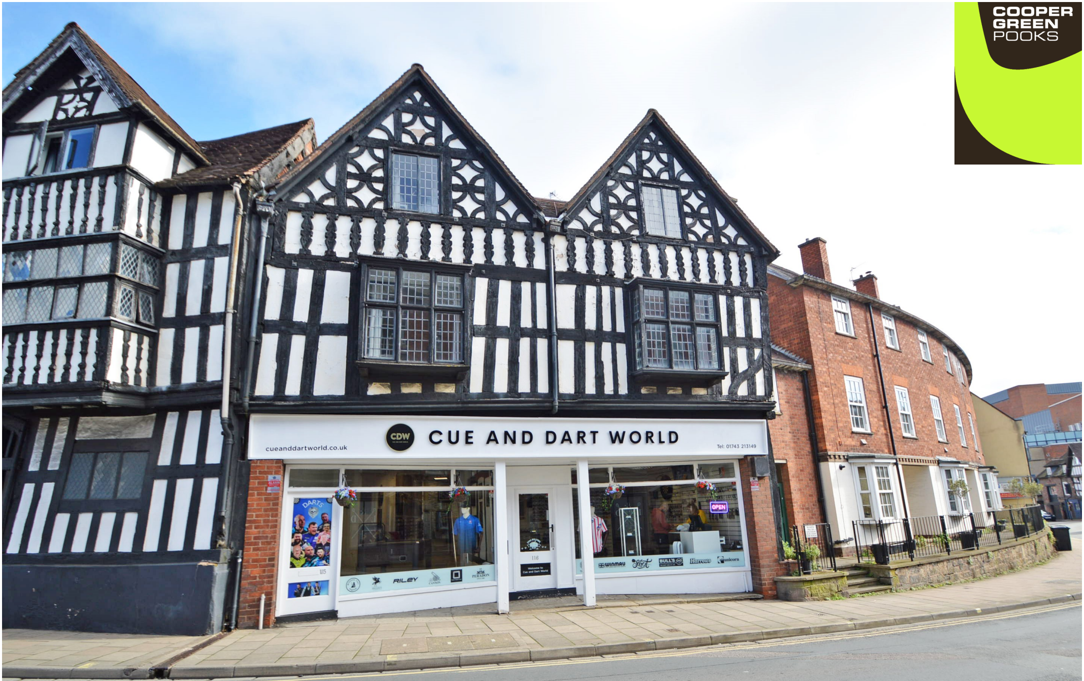
117 Frankwell, Shrewsbury, SY3 8JU 2 bedroom apartment—£135,000 Leasehold