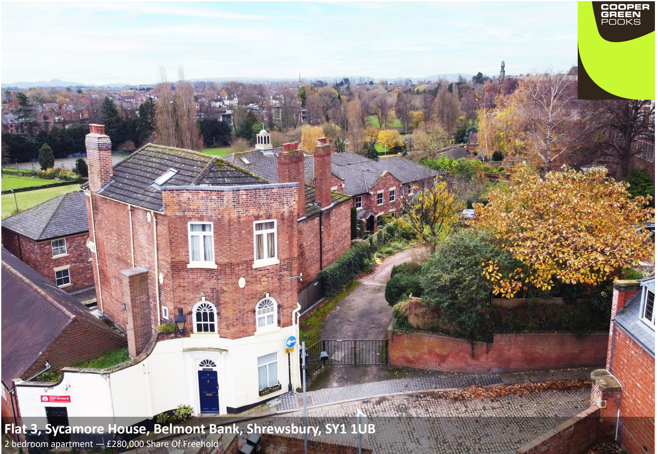
Flat 3, Sycamore House, Belmont Bank, Shrewsbury, SY1 1UB

2 bedroom apartment — £280,000 Share Of Freehold