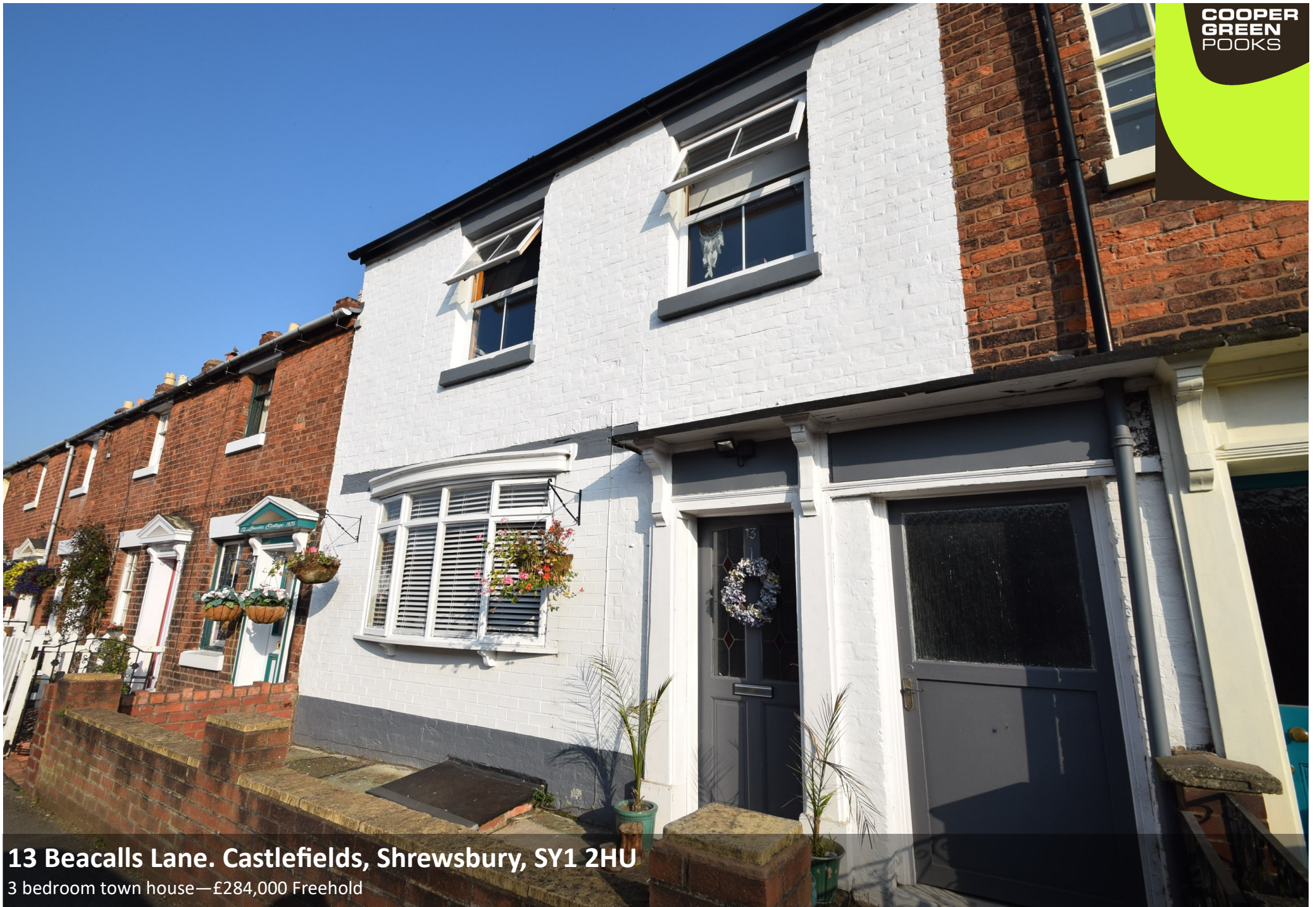
13 Beacalls Lane. Castlefields, Shrewsbury, SY1 2HU