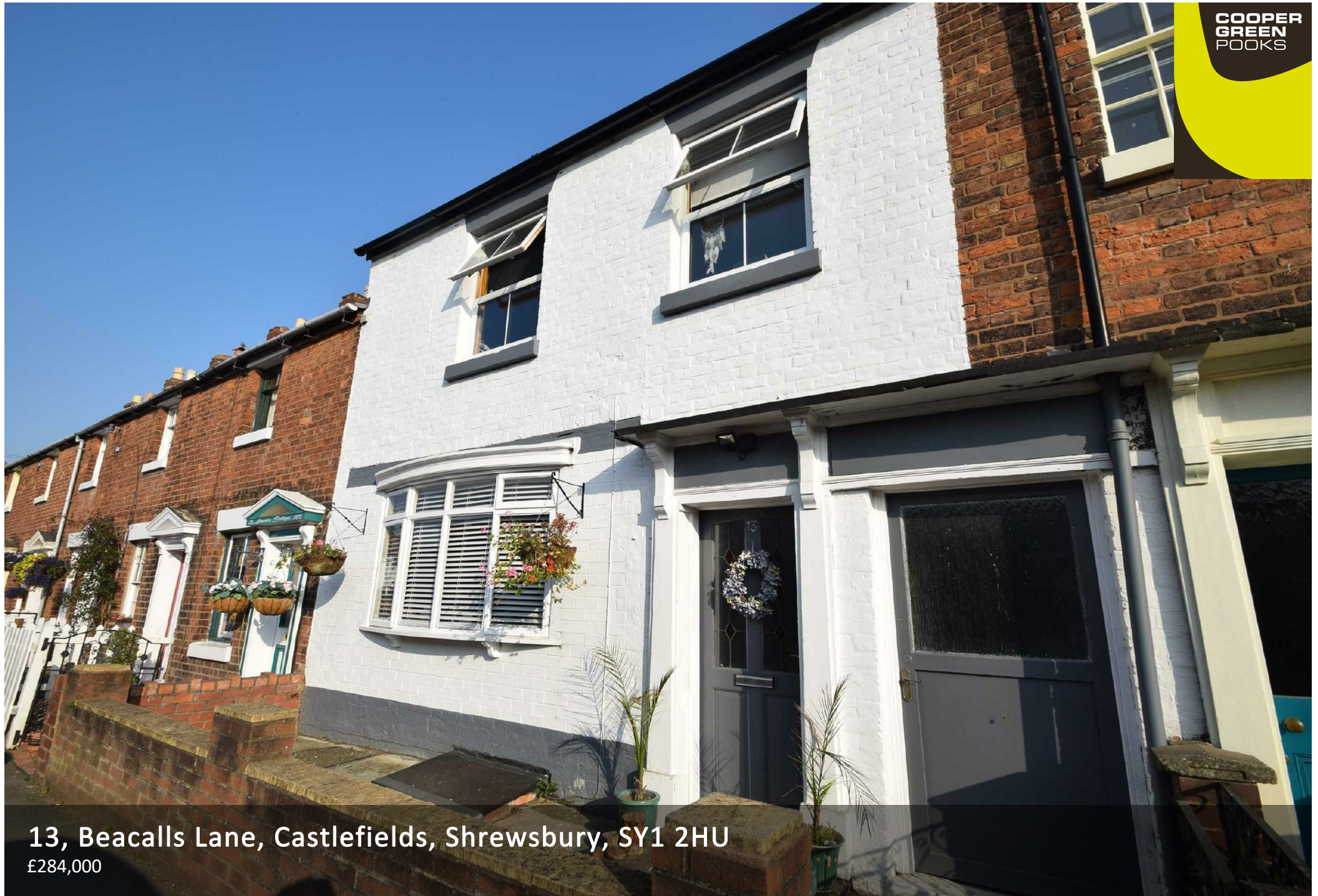
13, Beacalls Lane, Castlefields, Shrewsbury, SY1 2HU £284,000