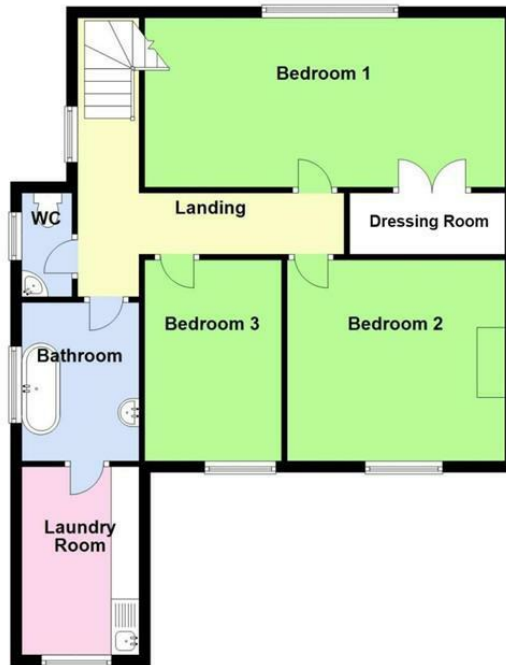
First Floor Approx. 72.3 sq. metres (778.3 sq. feet)