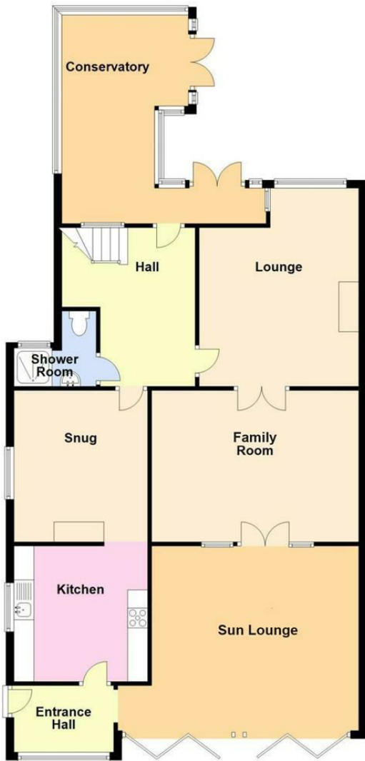
Ground Floor Approx. 126.0 sq. metres (1356.2 sq. feet)