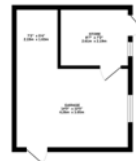
2ND FLOOR (11.2 sq.m.) approx.