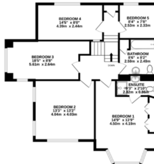
1ST FLOOR 890 sq.ft. (82.7 sq.m.) approx.