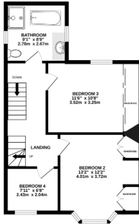
1ST FLOOR 540 sq.ft. (50.1 sq.m.) approx.