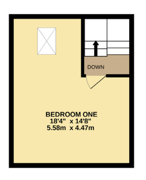
TOTAL FLOOR AREA: 893 sq.ft. (82.9 sq.m.) approx.