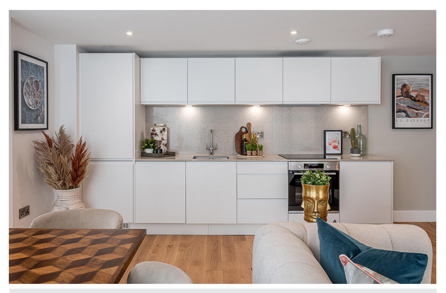
Set in the heart of Harrogate, Atlas House is located near Kings Road, an area regarded as one of the best locations in Harrogate, with an abundance of excellent restaurants, bars and shops nearby.

The apartment offers fabulous accommodation, comes fully furnished, ideal for the rental markets or Airbnb and has a highly refined specification, including ultra-modern kitchens with quartz worktops, upstands and Bosch appliances. The bathroom and en suites are luxurious with Villeroy WC's and sinks, Vessini baths and shower trays and luxury Porto white matt porcelain tiles and also include underfloor heating. The walls, woodwork and doors are all white, giving a bright and elegant finish allowing you to add your own stamp of design and colour.