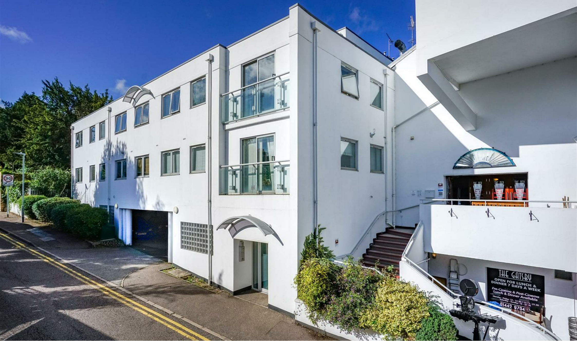
The Rex, High Street Berkhamsted