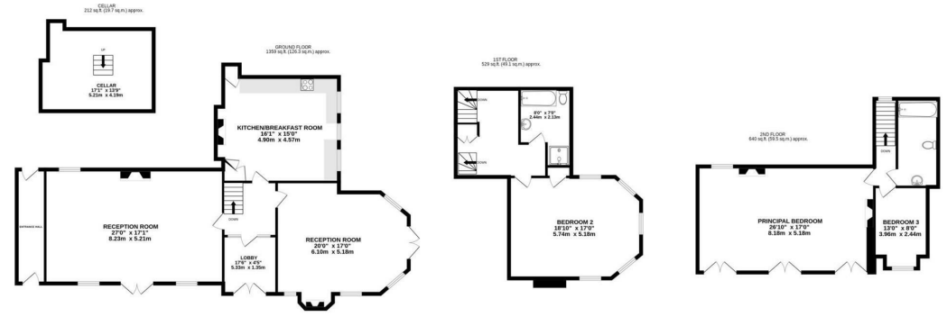
TOTAL FLOOR AREA : 2838sq.ft. (263.7 sq.m.) approx.

These particulars are produced in good faith, are set out as a general guide only and do not constitute any part of a contract. None of the statements are to be relied on as a statement of fact. Areas, measurements or distances are given as a guide only. We have not tested any of the equipment, appliances or services to this property nor do we have knowledge of any defects.