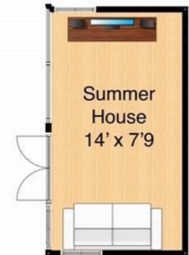
Yew Walk Yewlands Hoddesdon