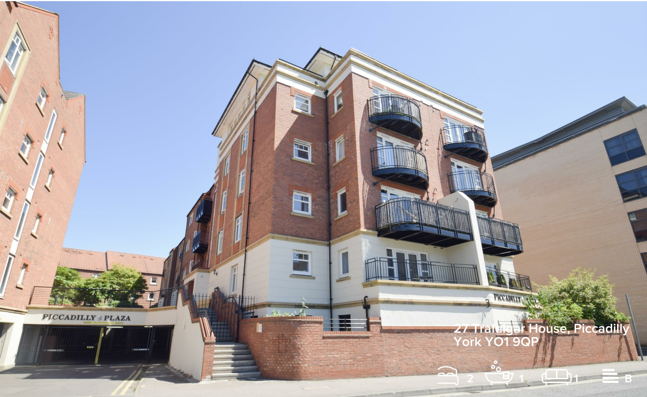
27 Trafalgar House, Piccadilly York YO1 9QP