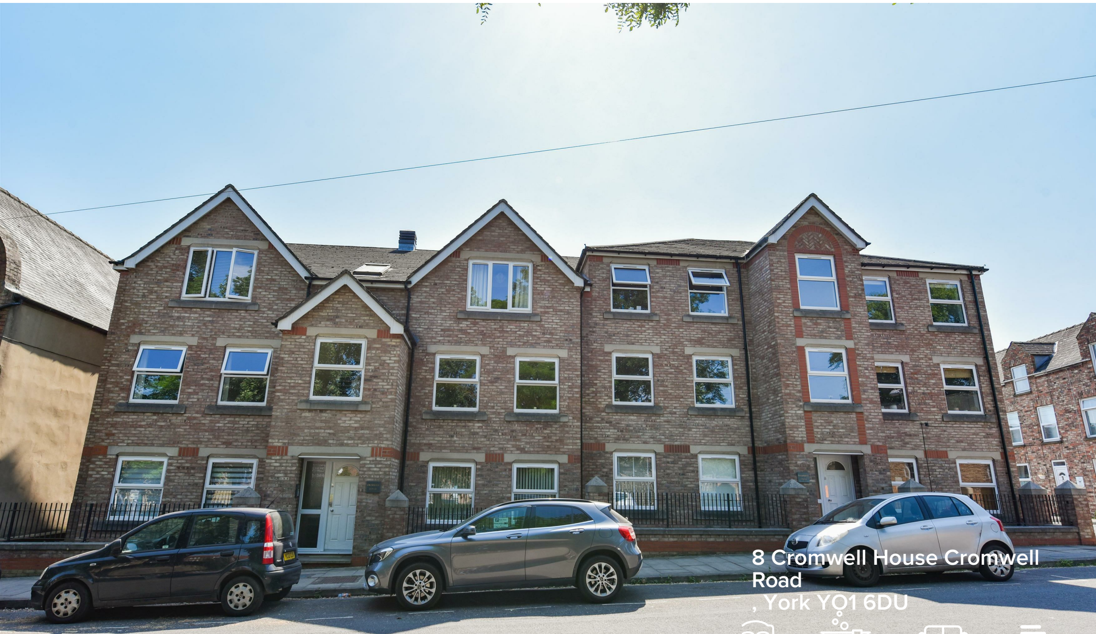
8 Cromwell House Cromwell Road , York YO1 6DU