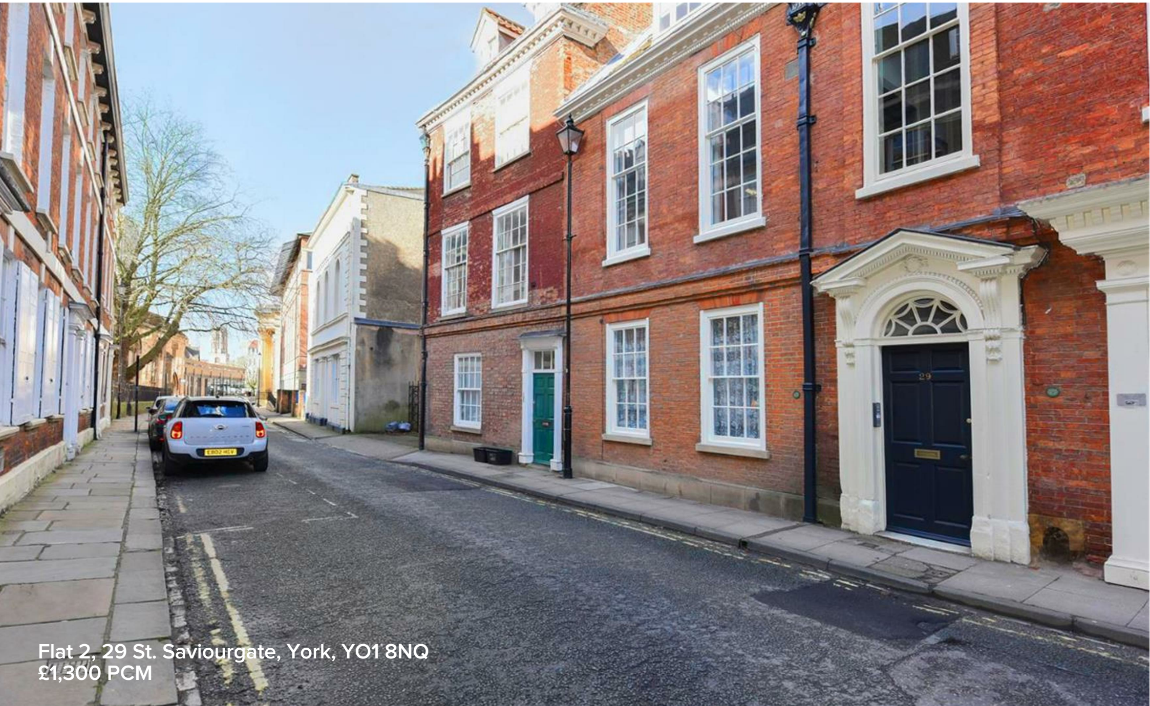
Flat 2, 29 St. Saviourgate, York, YO1 8NQ £1,300 PCM