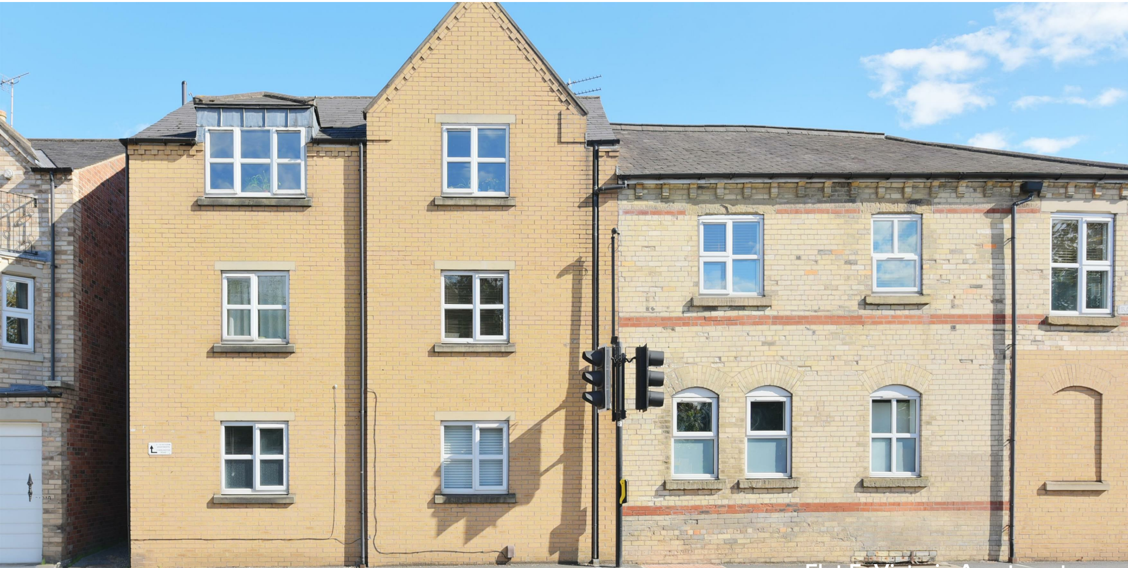
Flat 5, Victoria Apartments Heslington Road York YO10 5AT