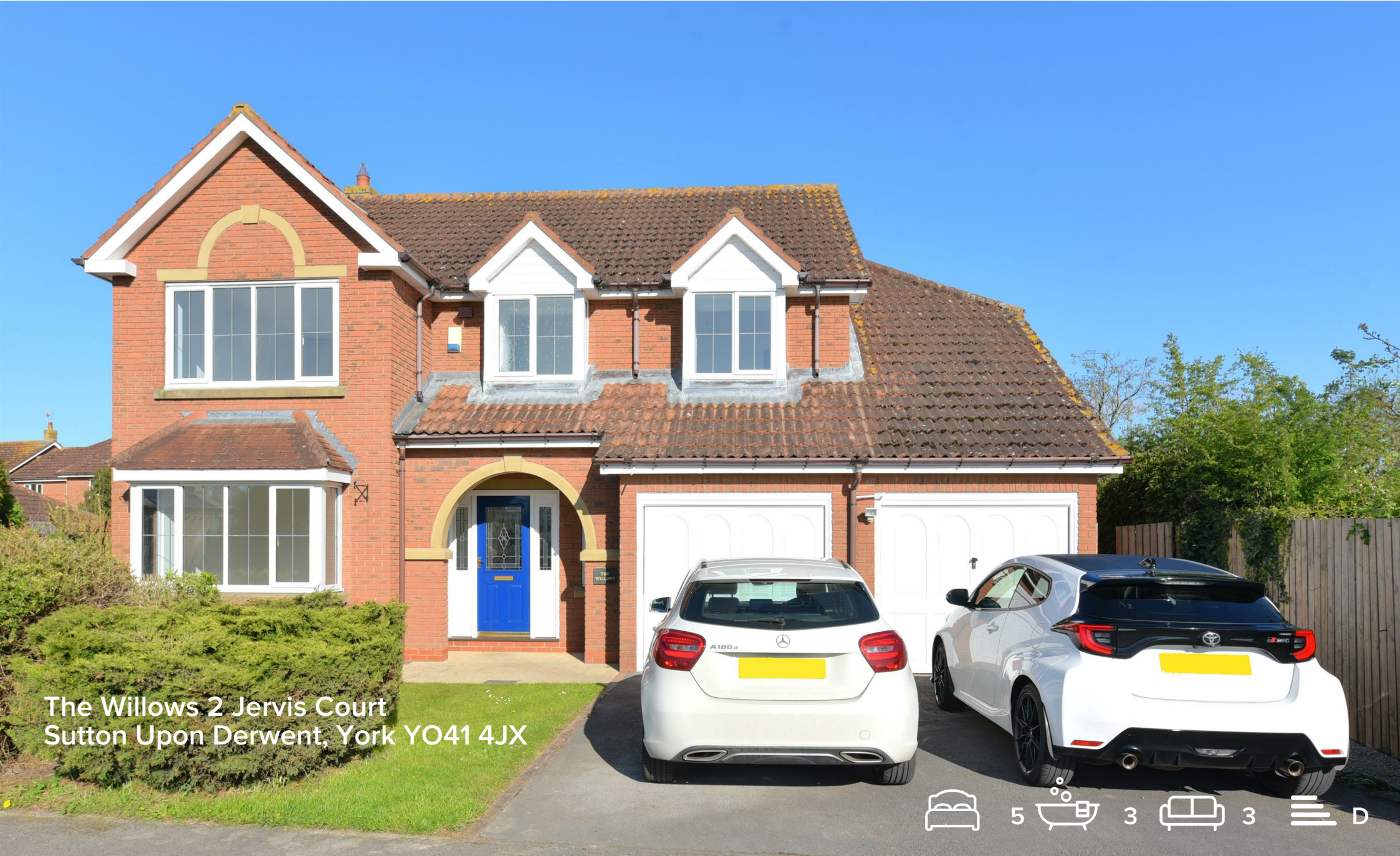
The Willows 2 Jervis Court Sutton Upon Derwent, York YO41 4JX