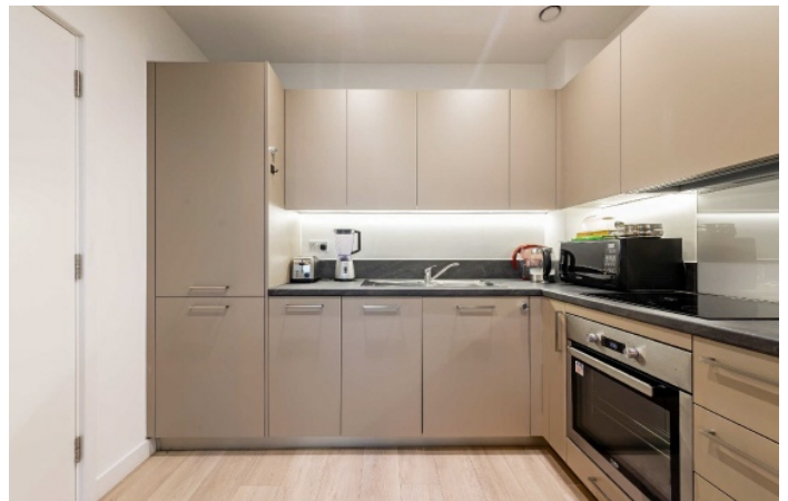
Coster Avenue, N4