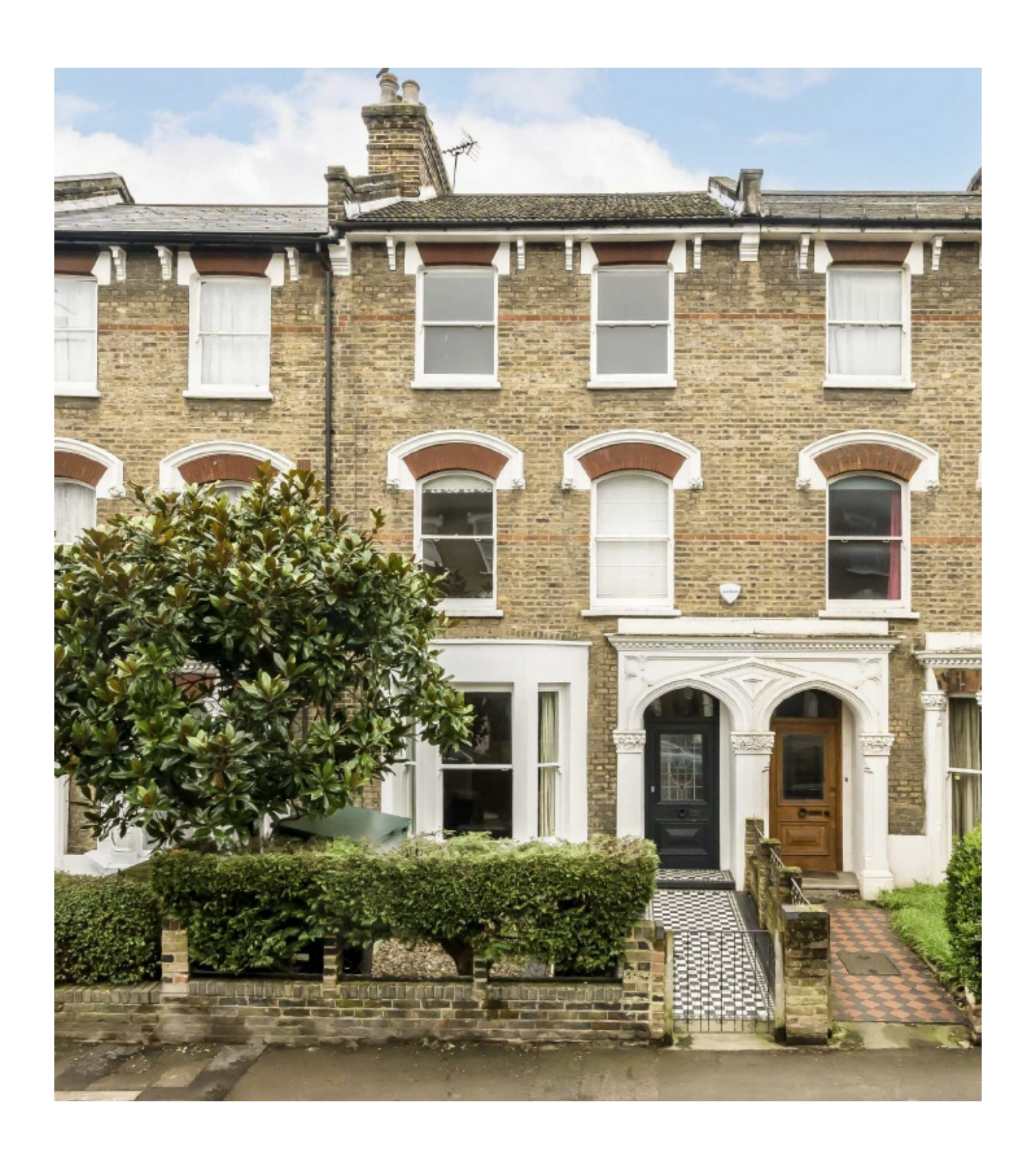
Florence Road, N4 £1,800,000