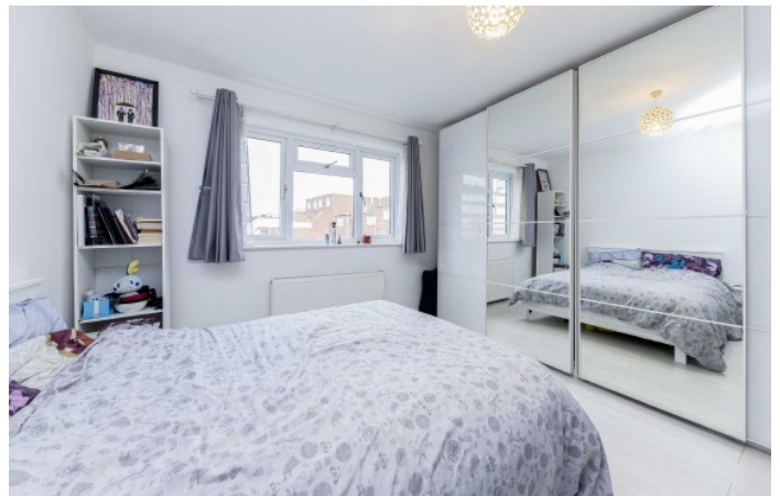
Tollington Park, N4