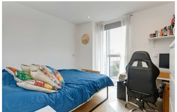
Woodberry Grove, N4