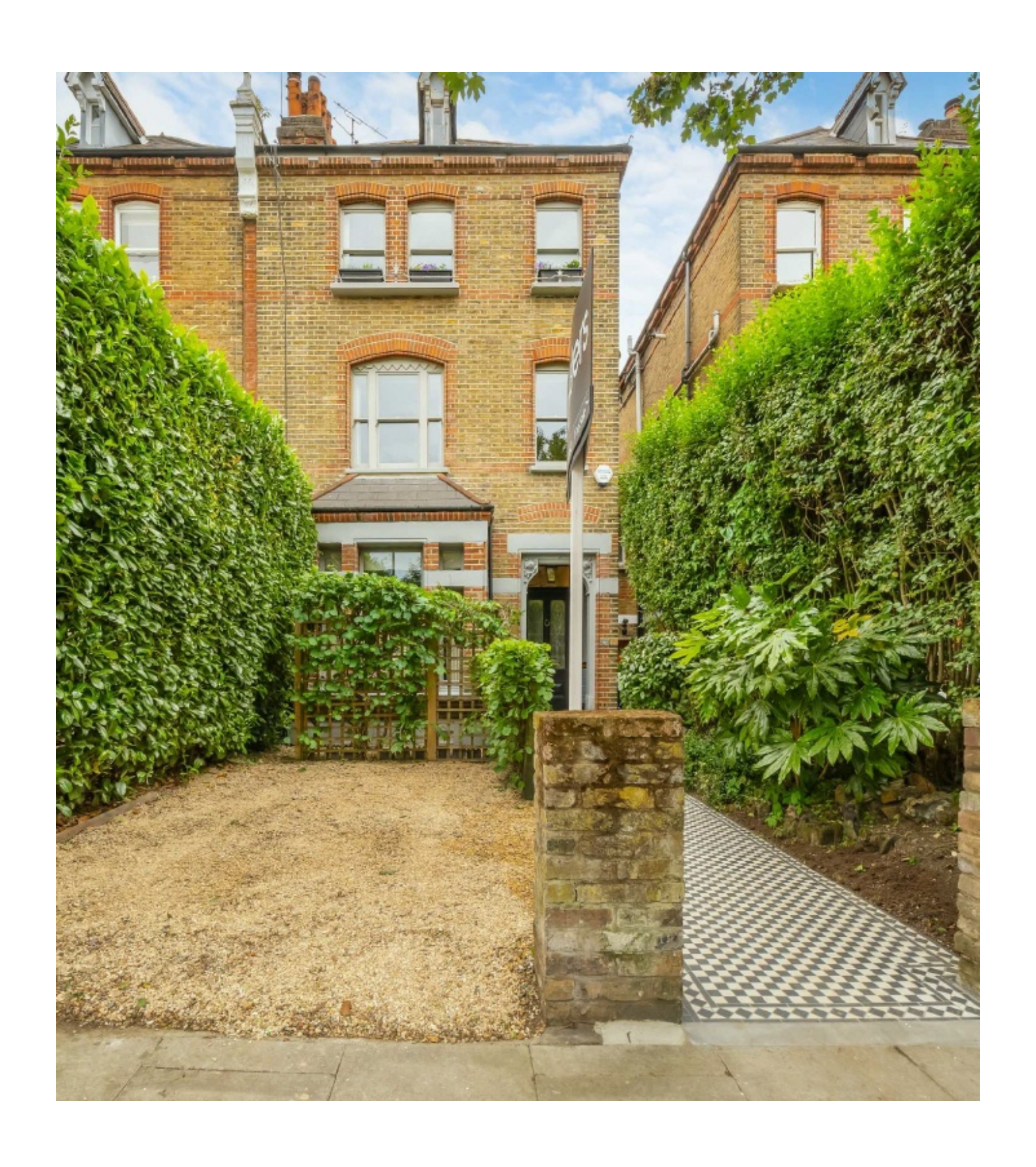
Tollington Park, N4 £2,000,000