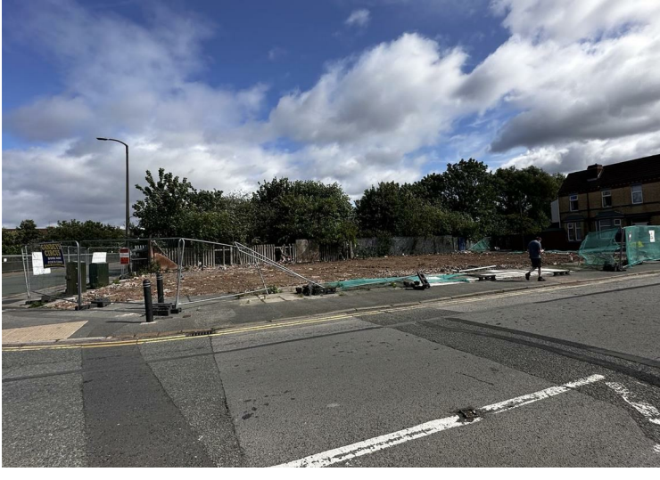
These particulars, whilst believed to be accurate are set out as a general outline only for guidance and do not constitute any part of an offer or contract. Intending purchasers should not rely on them as statements of representation of fact, but must satisfy themselves by inspection or otherwise as to their accuracy. No person in this firms employment has the authority to make or give any representation or warranty in respect of the property.