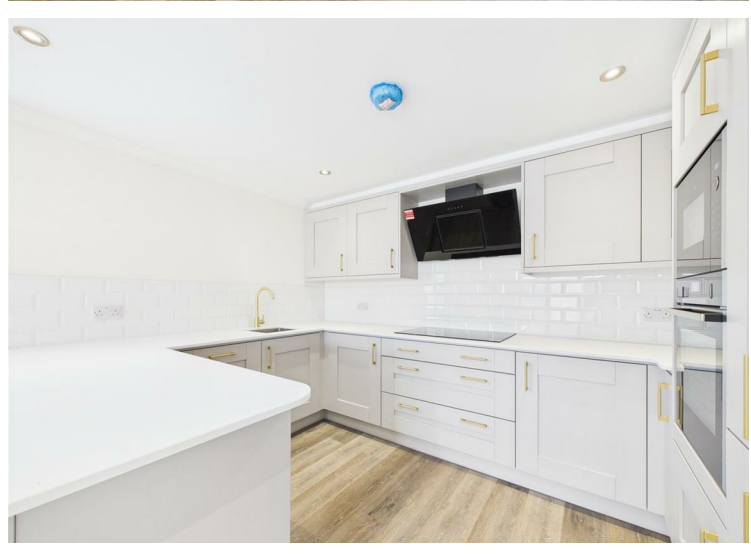
These particulars, whilst believed to be accurate are set out as a general outline only for guidance and do not constitute any part of an offer or contract. Intending purchasers should not rely on them as statements of representation of fact, but must satisfy themselves by inspection or otherwise as to their accuracy. No person in this firms employment has the authority to make or give any representation or warranty in respect of the property.