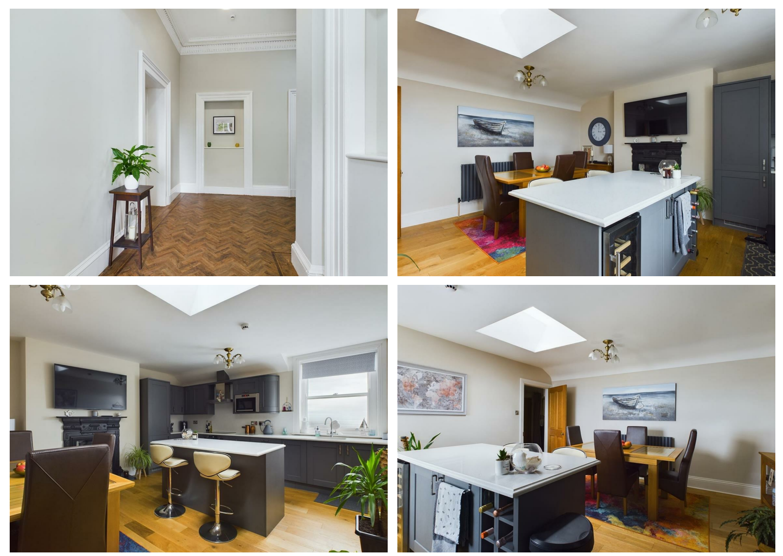
These particulars, whilst believed to be accurate are set out as a general outline only for guidance and do not constitute any part of an offer or contract. Intending purchasers should not rely on them as statements of representation of fact, but must satisfy themselves by inspection or otherwise as to their accuracy. No person in this firms employment has the authority to make or give any representation or warranty in respect of the property.

93-95 Wallasey Road, Wallasey, Merseyside, CH44 2AQ T. 0151 638 6313 | E. sales@bakewellhorner.co.uk https://www.bakewellhorner.co.uk/