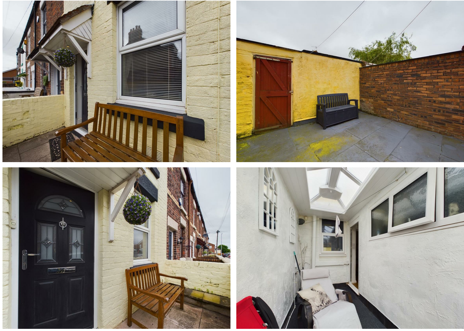
These particulars, whilst believed to be accurate are set out as a general outline only for guidance and do not constitute any part of an offer or contract. Intending purchasers should not rely on them as statements of representation of fact, but must satisfy themselves by inspection or otherwise as to their accuracy. No person in this firms employment has the authority to make or give any representation or warranty in respect of the property.

93-95 Wallasey Road, Wallasey, Merseyside, CH44 2AQ T. 0151 638 6313 | E. sales@bakewellhorner.co.uk https://www.bakewellhorner.co.uk/